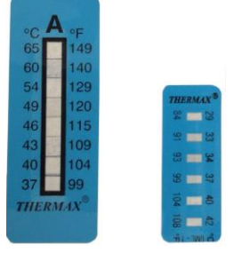
Boiler Sensor Concrete/subfloor Sensor

**IMPORTANT ** when using any radiant heat system other than the in slab system referred to above, you must confirm with your heating contractor that the Maximum Temperature of the surface of the sublfloor (below the hardwood flooring) CANNOT EXCEED 81F (27C).