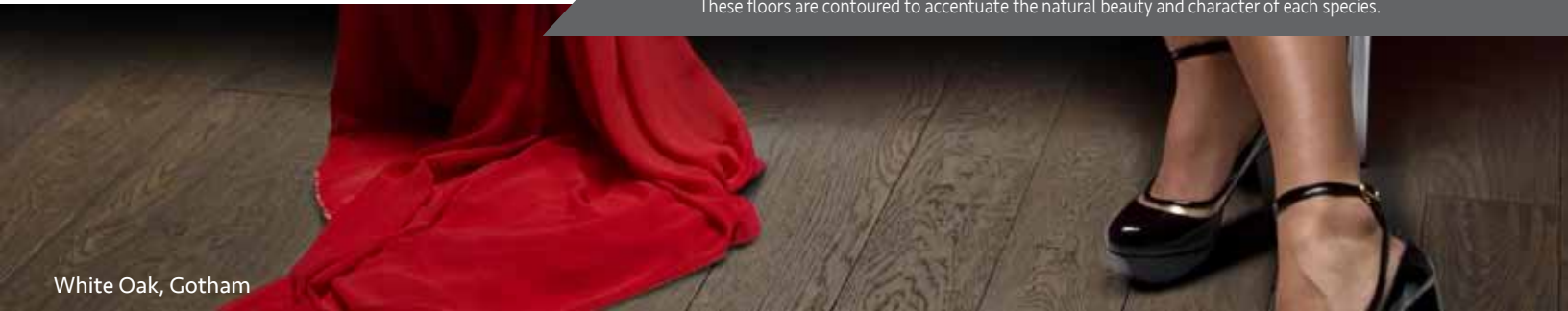
White Oak, Gotham

Popular for hundreds of years, Hand Scraped hardwood has a distinct sculpted look and old world feel. Not to be confused with machine scraped hardwood that has a repetitious pattern, each board of Vintage's hardwood flooring is scraped and crafted by hand, and then stamped by the craftsmen, making each board unique. Hand Scraped floors tend to be more low maintenance compared to a smooth finish and help hide every day wear. These floors are contoured to accentuate the natural beauty and character of each species.