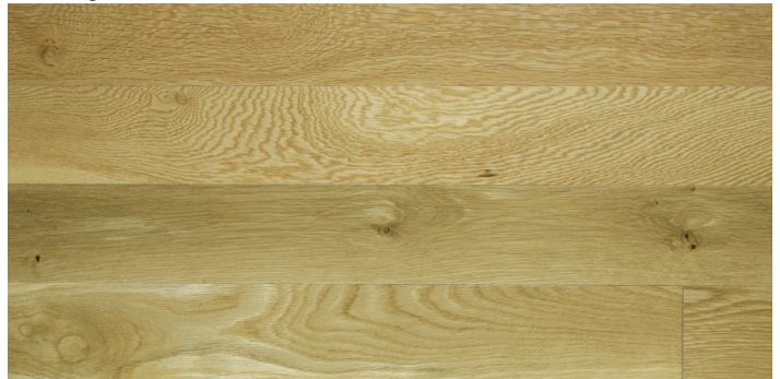
White Oak Plain Sawn Select-V

Select-V consists of a blend of heart and sapwood, 1/4" sound filled knots with some voids allowed. Splits, checks are not part of this grade.