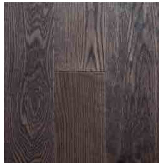
UVF (Ultra full finish)

A modern finish that is in between Pearl and UV Oil. Great for textured wood to hide everyday wear and tear such as scratches and dents.