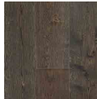
UV Urethane Oil (Ultra Matte)

A matte finish that provides a look that mimics oxidative oil, yet offers some attributes of a urethane finish with some repair characteristics of an oil finish.