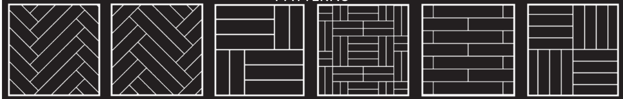
HERRINGBONE 3 1/4" X 14.68", 5" X 30" DOUBLE HERRINGBONE 3 1/4" X 14.68", 5" X 30" BASKET 5" X 30" FENCE 5" X 30" BRICK 3 1/4" X 14.68", 5" X 30" CUBE 5" X 30"