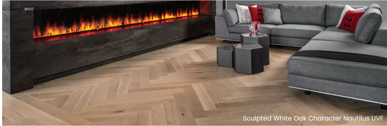
Sculpted White Oak Character Nautilus UVF