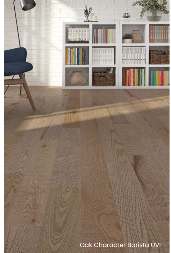
Oak Character Barista UVF

Pioneered® solid: Plywood Northern Solid Sawn®: Plywood or concrete