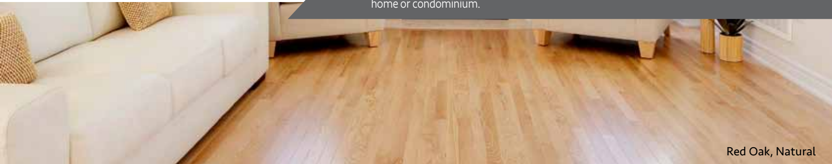
Red Oak, Natural

U-LOC ® is Vintage's Do-it-yourself friendly product. It is unique as it is a structured floating floor with an easy to install locking system making installation quick and easy. U-LOC ® comes in Select-V Grade in 4 1/4" width and lengths ranging from 13" (350 mm) to 46" (1177mm). Available in Hickory, Maple and Red Oak species, U-LOC ® flooring is a great addition to any room in your home or condominium.