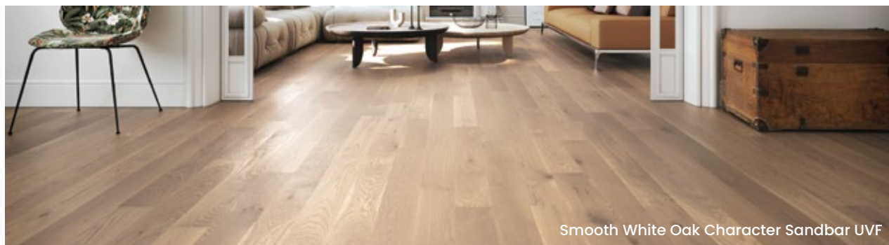
Smooth White Oak Character Sandbar UVF