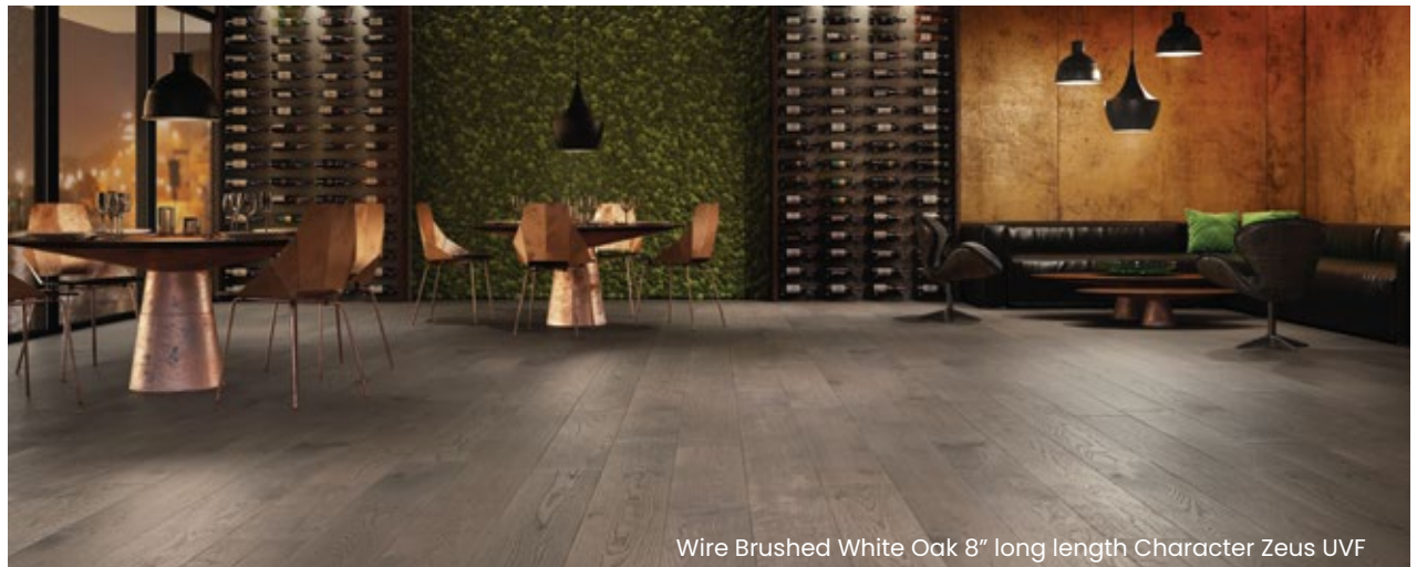
Wire Brushed White Oak 8" long length Character Zeus UVF