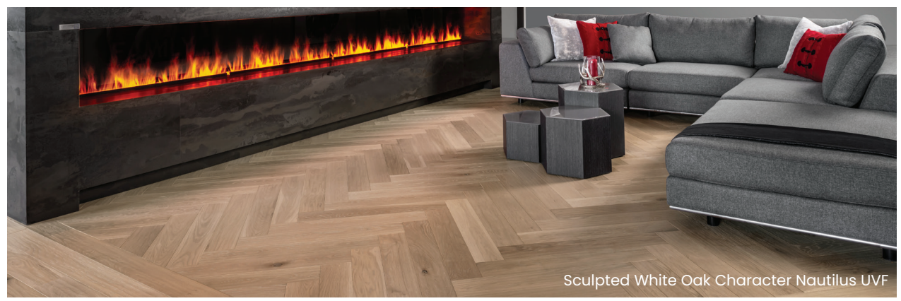
CUBE 5" X 30"