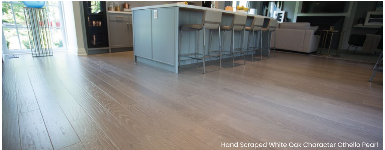
Hand Scraped White Oak Character Othello Pearl