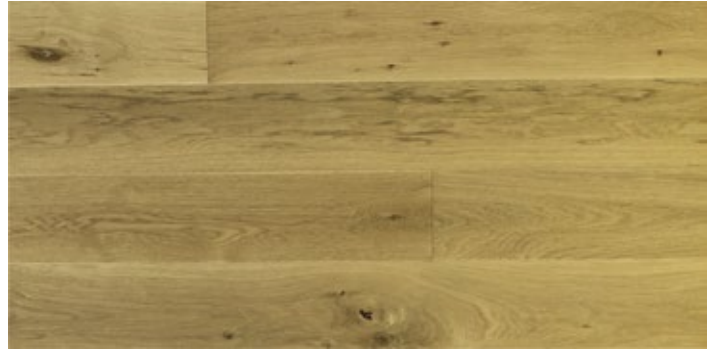
White Oak Character

Unlimited color variation and naturally occurring characteristics. Unlimited sound filled knots (no limitation of size), checks and splits. Some voids are allowed.