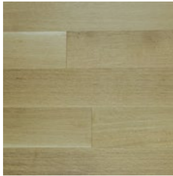
White Oak Rift & Qtr. Sawn Select-V