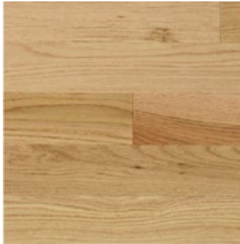
Red Oak Select-V