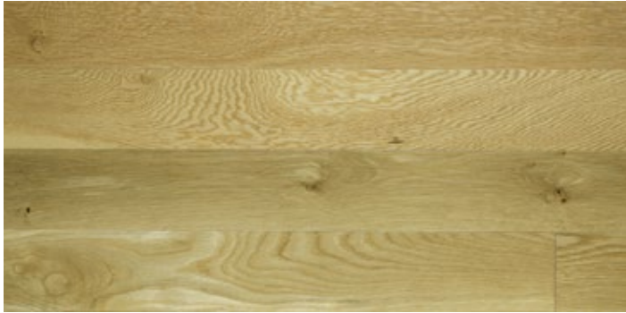
White Oak Select-V

Select-V consists of a blend of heart and sapwood, 1/4" sound filled knots with some voids allowed. Splits, checks are not part of this grade.