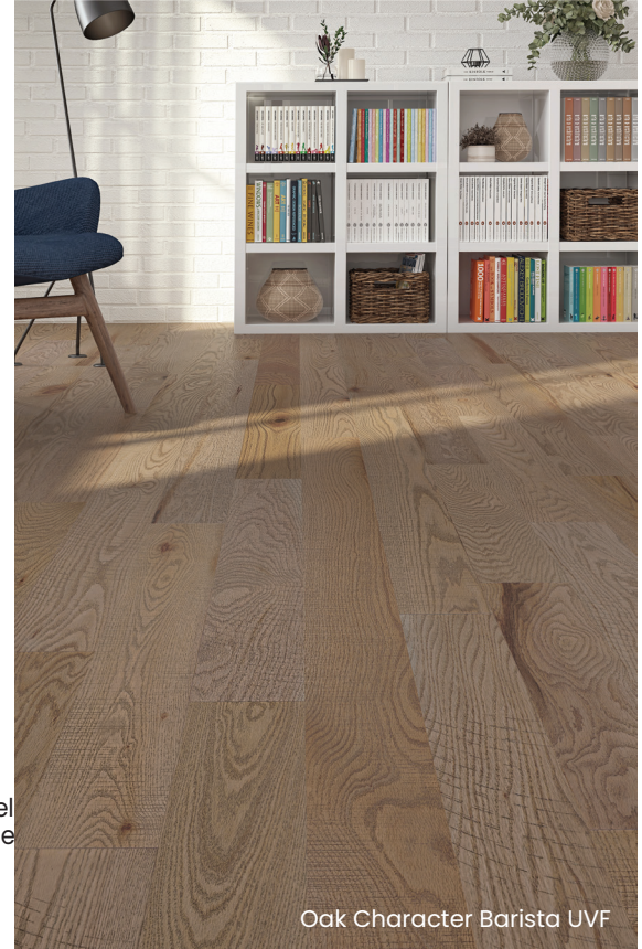
Oak Character Barista UVF

Pioneered® solid: Plywood Northern Solid Sawn®: Plywood or concrete