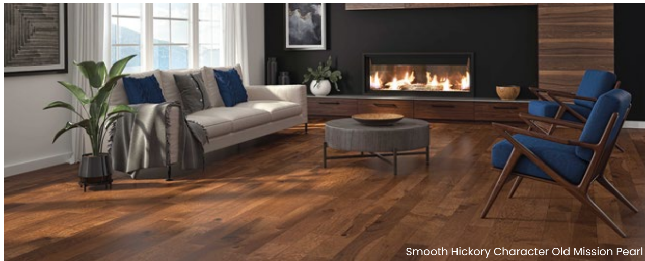
Smooth Hickory Character Old Mission Pearl