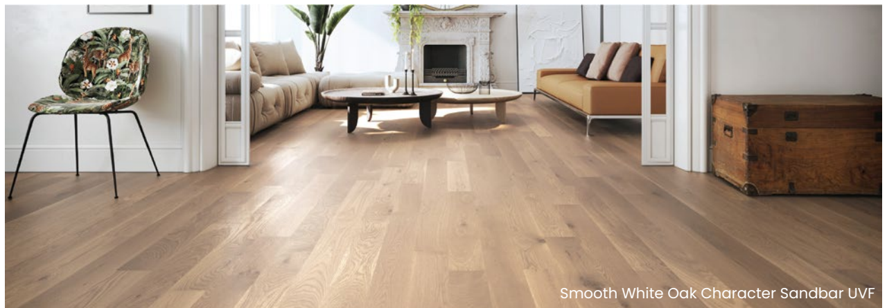
Smooth White Oak Character Sandbar UVF